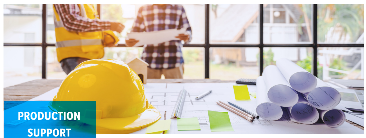
KIP CONTINUES TO SET THE BENCHMARK FOR PRODUCT SUPPORT AND CUSTOMER CARE EXCELLENCE